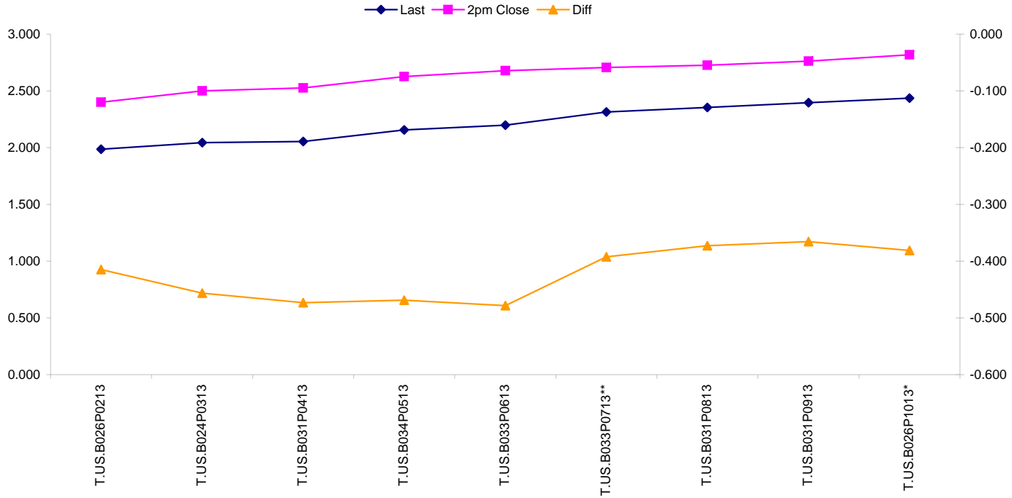
5 Yr Deliverable Curve